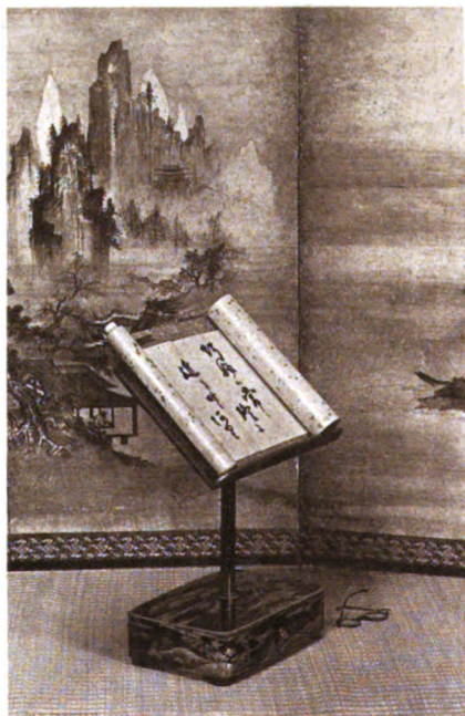
EX LIBRIS RUSSELL GRAY